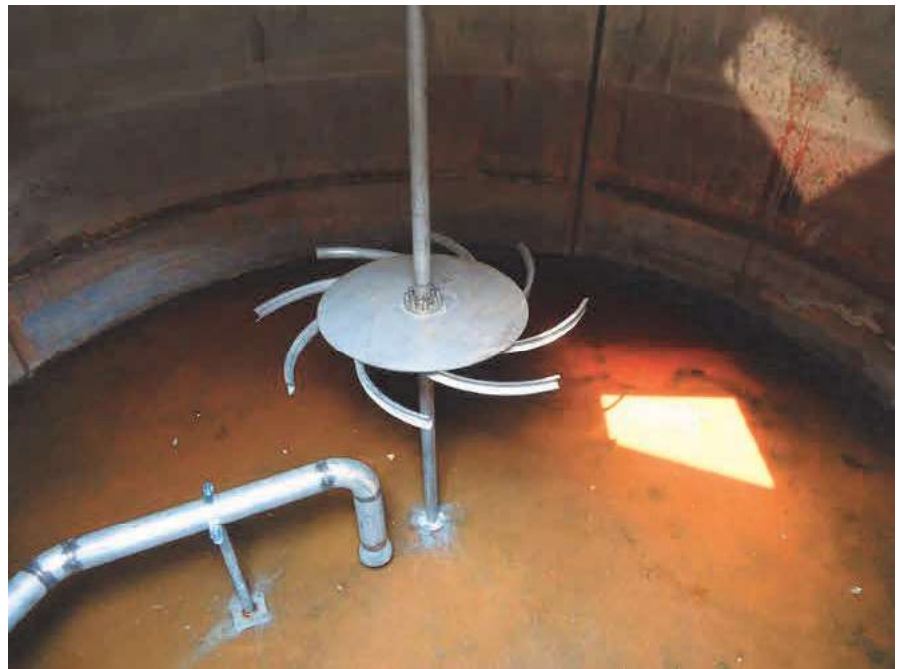
A high performance centrifugal dispersing impeller used for sludge mixing at the Banff WWTP.

The difficulty with wastewater mixing is rooted in complicated physical attributes of the water, multiple process objectives, misunderstanding and limitations of mixing technology.