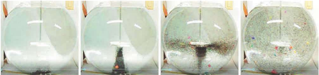
Figure 1. The high performance centrifugal dispersing impeller (HPCDI) suspends solids with a tornado like force.